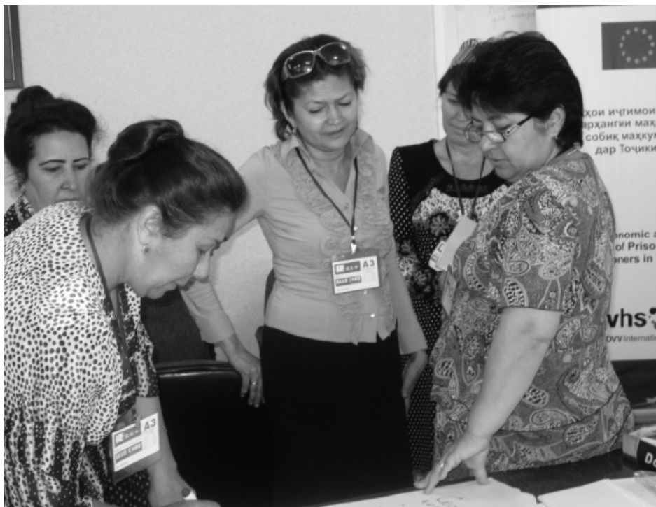
Training of prison educators in Dushanbe 2014

also for the staff of penitentiary institutions. The participants were able to deliberate on how to harmonize the national legislation of the Republic of Tajikistan with the international standards. One of the main conclusions made by the trainees was that low professional and legal preparedness of the penal staff leads to use of coercive methods: harassment, violence, threats and other illegal measures.