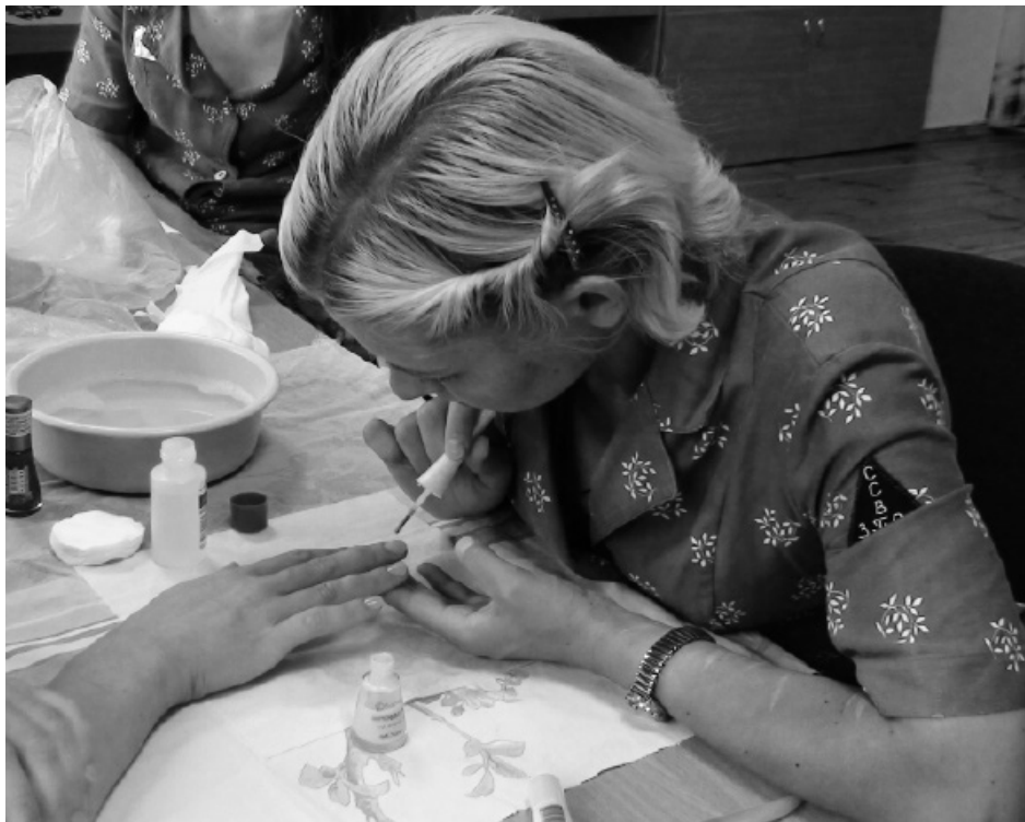
Manicure and pedicure diploma course for female prisoners

e) Forming the groups with regard to gender, social status, age and level of the trainees, e.g. male inmates who had repeatedly violated the established order of serving their sentence, as well as individuals requiring more attentive supervision (potential offenders) were invited to enrol in the social and psychological support programme. The social adaptation level of the target group members was evaluated as insufficient, whereas the level of “criminal contamination” was reported to be relatively high. It manifested not only in the violation of the regimen, but also in the absence of a stable place of work, and unwillingness to restore the old socially useful ties as well as establish new ones. In the female correctional colony, training groups were formed of female inmates with 6-8 months left until release. In both cases the main principle of enrolment was voluntary consent of the prospective trainee.