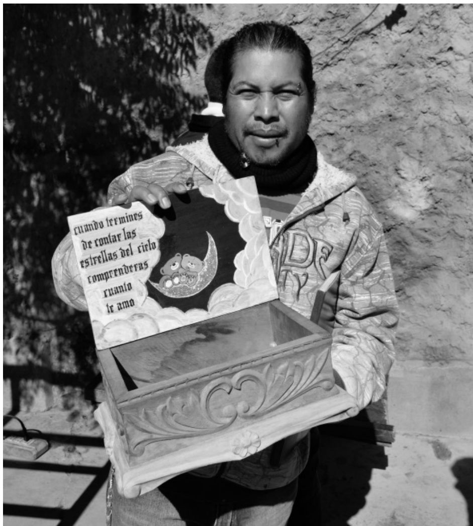
Inmate presenting his work for his daughter, Prison Morros Blancos, 2014

the construction of the theoretical, in the discussion of strategies and in the development of educational conduct for educational activities. The participatory nature of the action of building educational policies shows the collective essence of educational change.