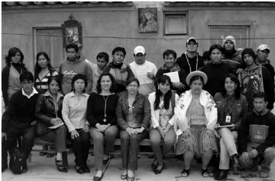
Closing session of the workshop Painting on Fabric and Woodcarving 2011