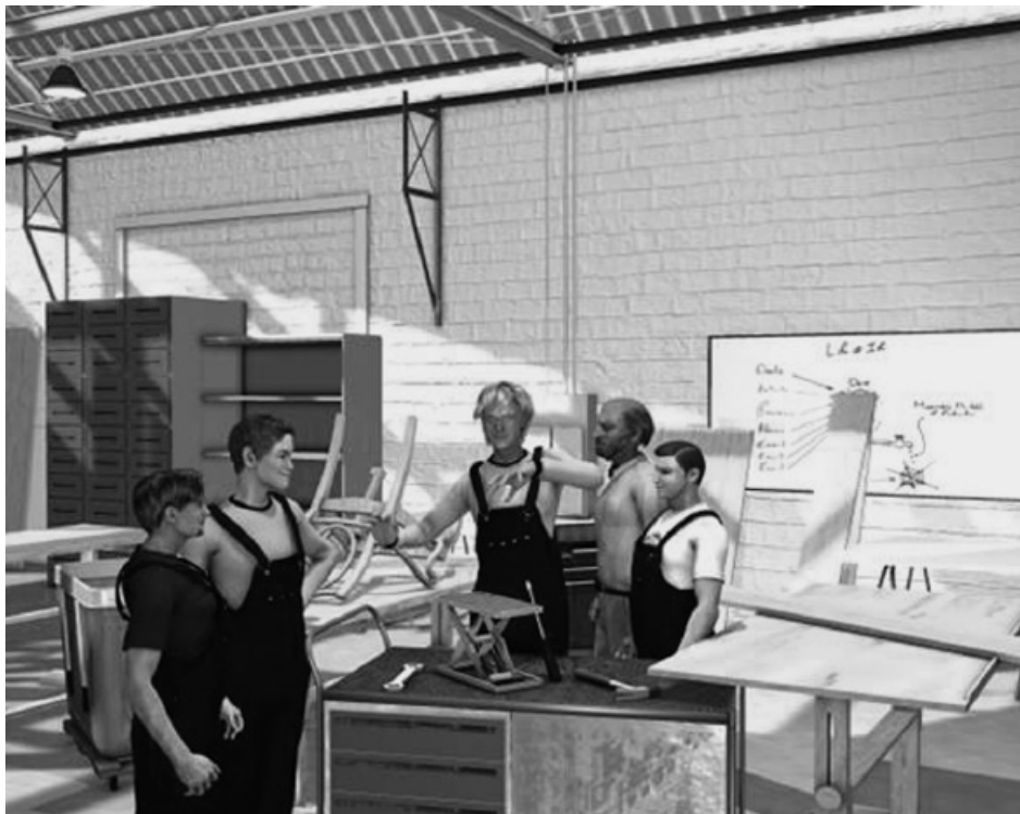
Example picture of the topic "work"

certificate exam and is available for use anywhere. Since 2007, the online portal www.ich-will-lernen.de has been available to prisoners and teachers in correctional facilities as an attractive and modern way of training.