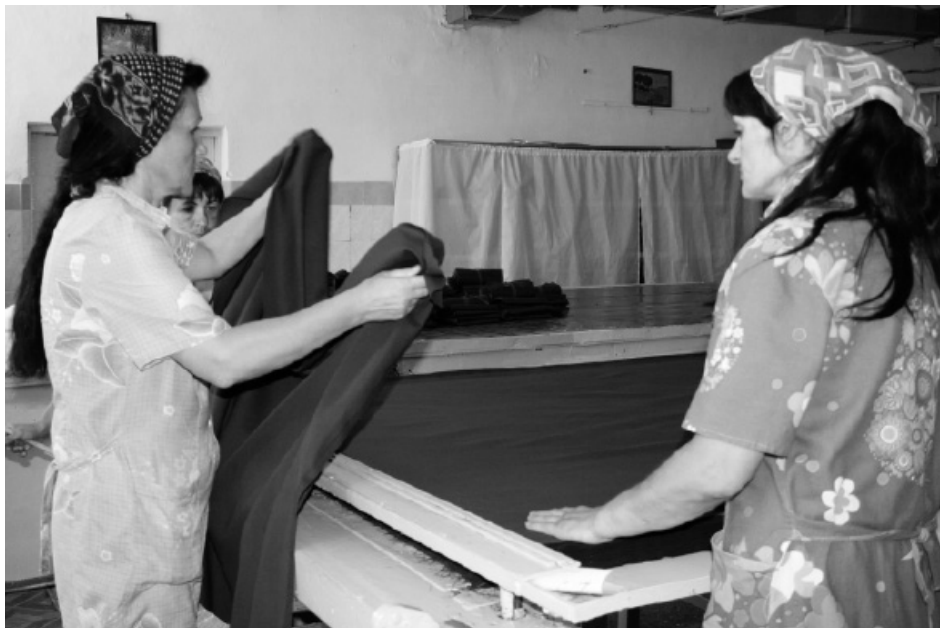
Vocational training on sewing for female prisoners

steps after release” are provided. There is a general idea in our society that prisoners are kept in hard conditions in a penal institution, and this is in fact true. But the real problem begins with the release from prison.