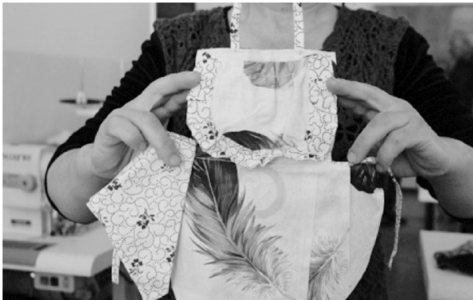
Presenting vocational training results made by an incarcerated woman