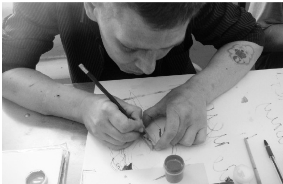
Participant of a life skills course, which was a crucial part of the vocational training programme