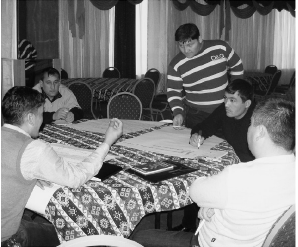
Further training for prison staff on professional ethics

ment of lawyers, psychologists, representatives of governmental structures (Centres of social adaptation, Ministry for Labour and Social Protection) and public authorities. At the meetings the participants were encouraged to share problems they faced after release. Among the problems they have experienced were: registration at the former place of residence, registration and obtaining documents, obtaining free law consultations and medical care, limitations due to impossibility to work in a profession, low salaries, psychological problems associated with the rejection of an ex-inmate by relatives and friends, impossibility to help the family due to the absence of work. Some women shared their successful experience of solving problems. The main conclusion to which the participants came is that the preparation course for release should start from the first day of serving a sentence, not just several months prior to release. After release