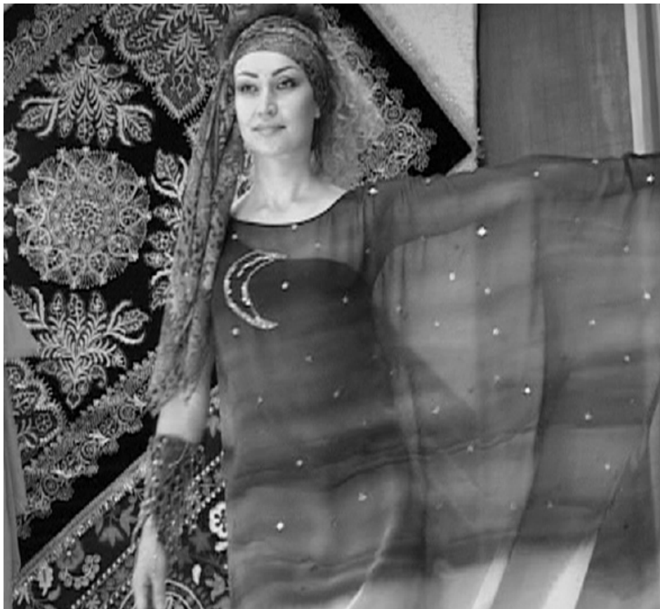
Presentation of the project results in 2011. All textiles were made by incarcerated women on vocational courses supported by the project

the opportunity to think about their life, in 2013 a diary with the title “Time manager” was developed and included a calendar, motivating postcards, poems and articles with various issues, such as “What should be done in order to obtain self-esteem?”, “The best make-up”, “How to get over your own fears and problems”, “Why can you not be liked by other people?”. After each text the diary contained plain sheets to give the inmate the possibility of writing personal notes. Women have already asked for the continuation of this action because they liked the idea, and now they are proposing themes which can be included in the next diary.