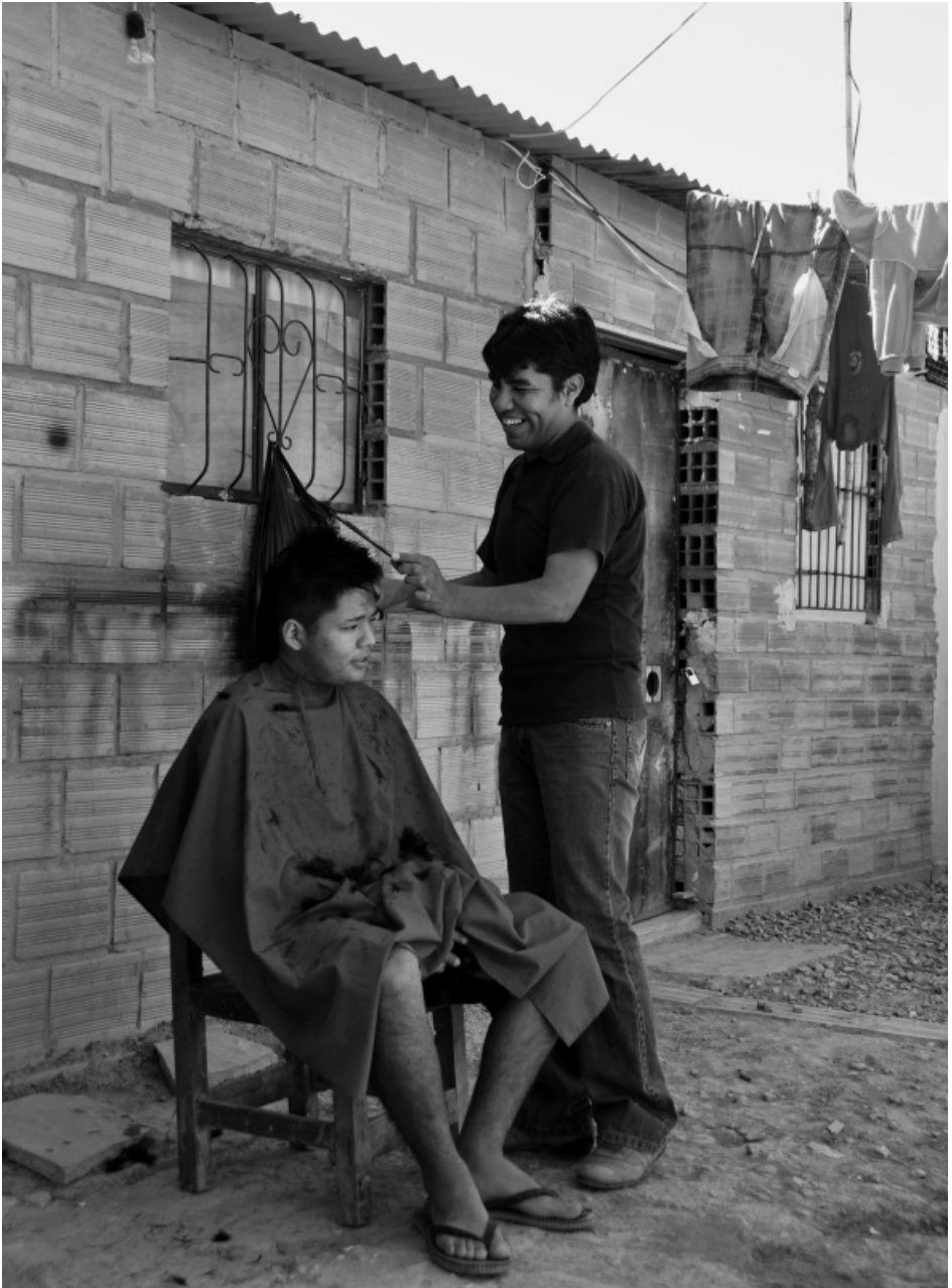
Inmate working as hairdresser, Prison Morros Blancos, 2014