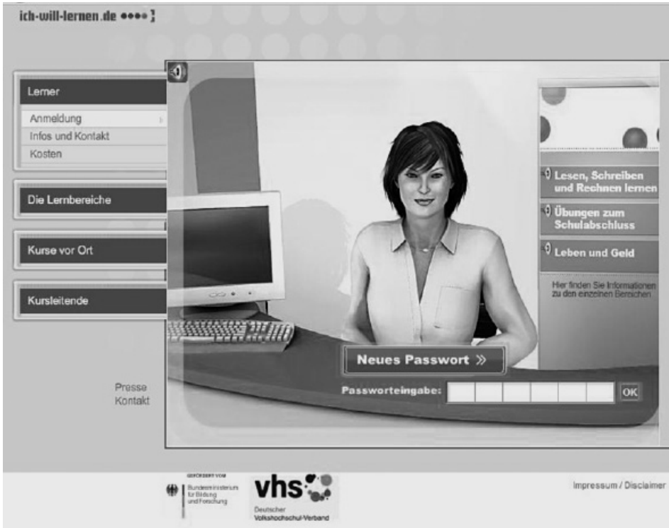
Homepage of www.ich-will-lernen.de

messages via PC through a special system, a service that is, however, connected with significant costs for the users.