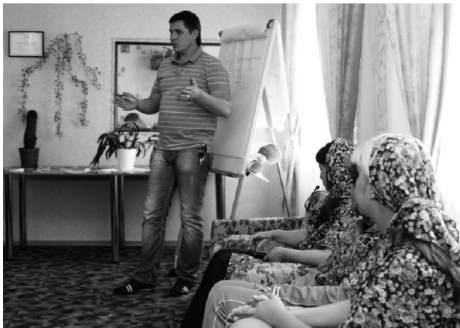
Life skills training for female prisoners in Poltava City

managed to attract another partner, Poltava City Employment Centre, that allocated funds in the amount of 56,000 hryvnia from the fund of obligatory state social unemployment insurance to be paid for public works of our clients, and owing to this, 35 jobs were found for former prisoners.