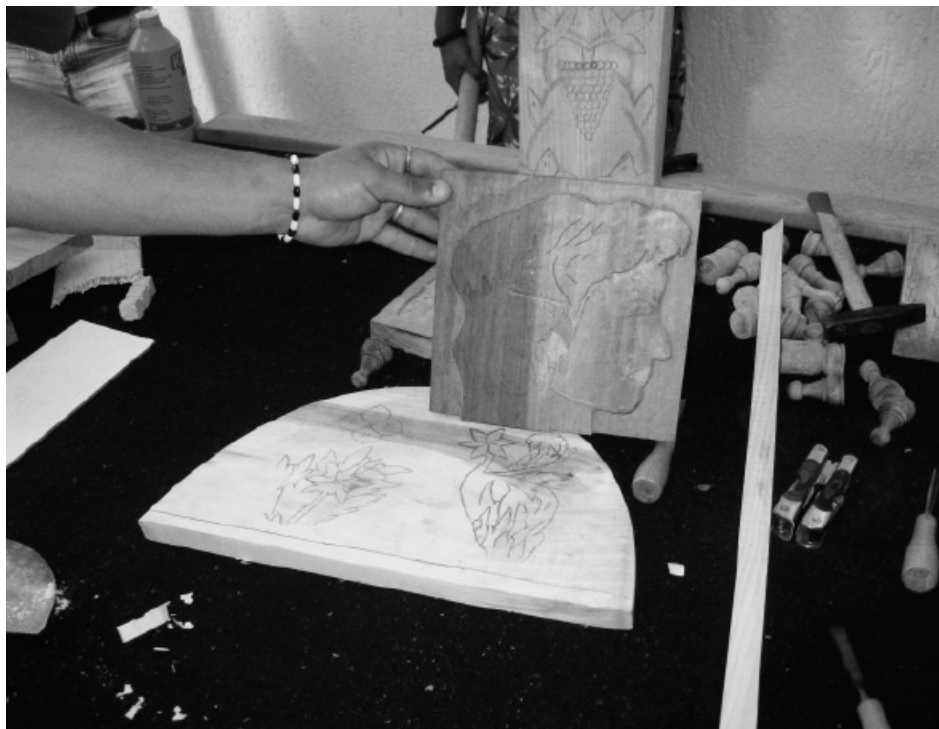
Products of the woodcarving classes in Tetovo prison

cussed topics. The training sessions were completed successfully by all participants.