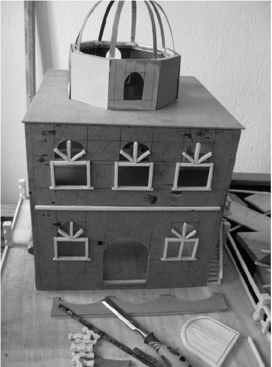
Products of the woodcarving classes in Tetovo prison