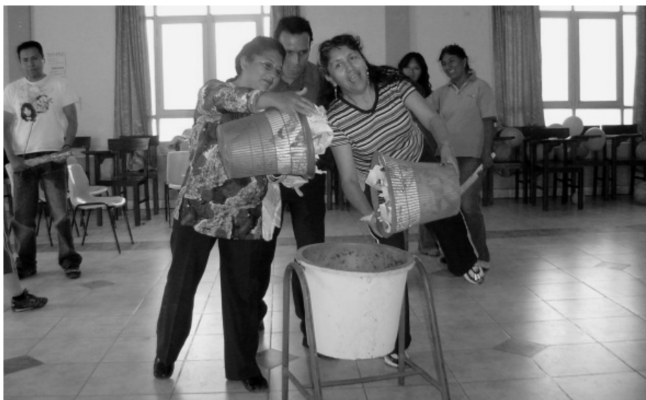
Participatory technique – first diploma course in prisons, 2008