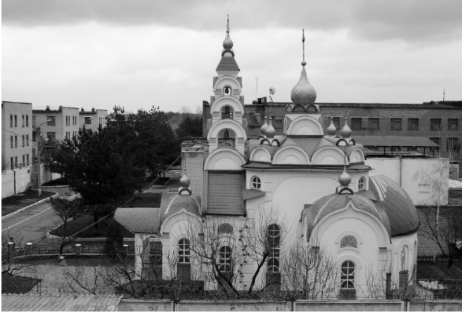
View of the prison complex in Poltava City

efficiently, and besides, to exercise their vision: to add new elements, to offer new alternatives of versions of both elements and construction as a whole.” Another significant point, according to the teacher, is the environment in the group. “All students are equal to each other. They all have their own destinies, the term that they spent in prison, but they have an equal chance to start life anew, acquire a profession, recover the existing and establish new social ties, settle down to a married life.”