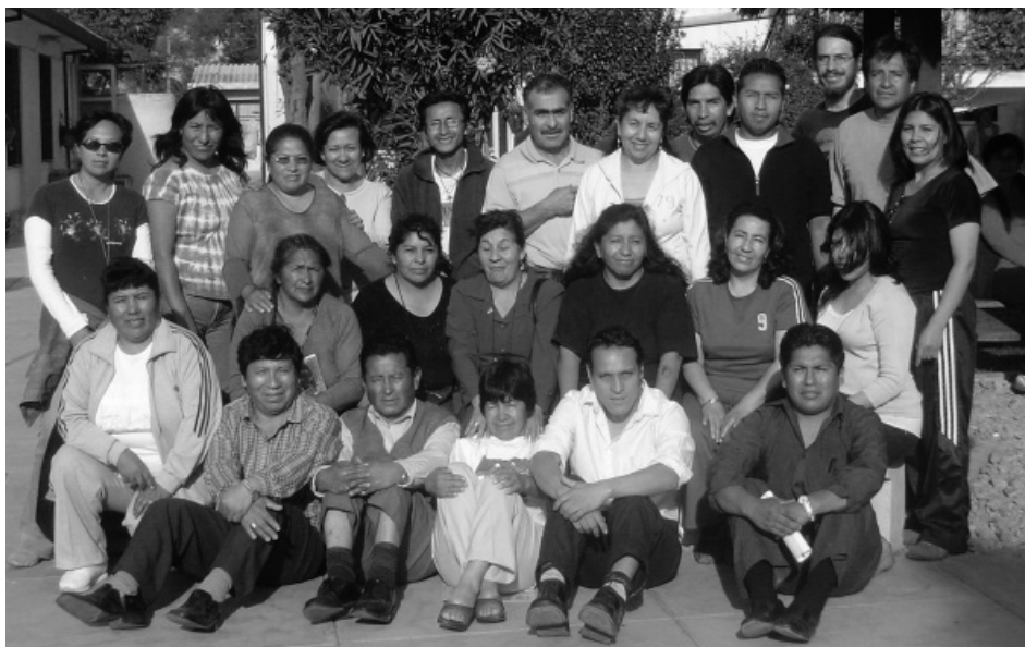
Participants of the first diploma course in prisons, 2008