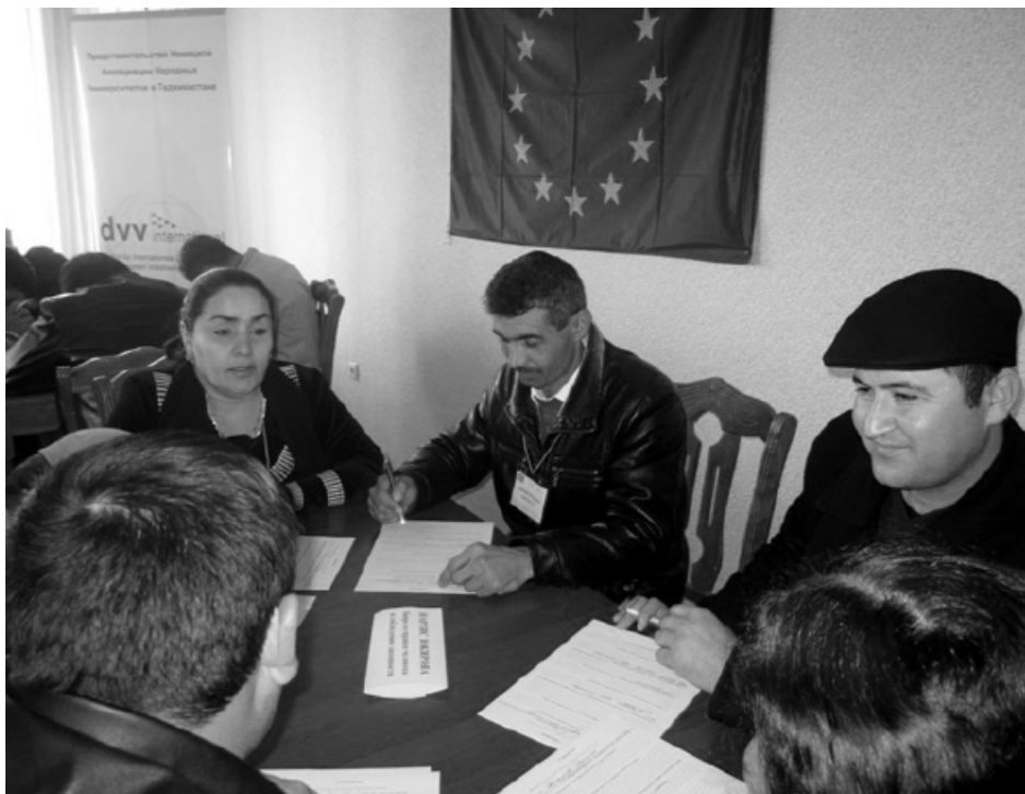
Training of prison staff on international standards of detention of the incarcerated

(Training of Trainers) on adult learning methodology and coaching for vocational masters/instructors to be prepared by the female prison staff. The civic education and personal development trainings for female prisoners are an important component of the project. In addition, a set of events will be arranged in the female prison during the Education Days planned by Jahon.