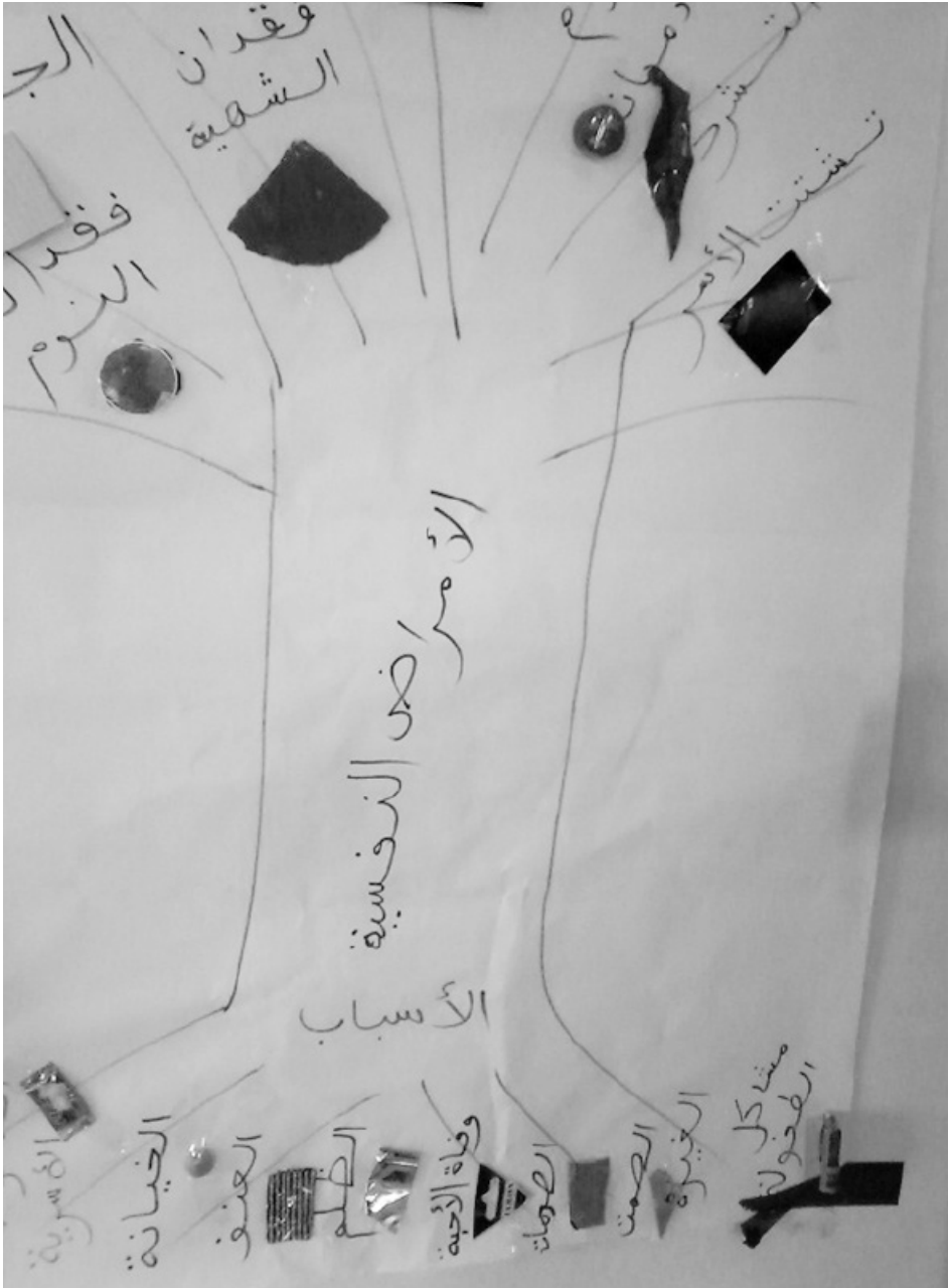
The Reflect-method uses the so-called "problem tree" as a tool for visualisation and analysis