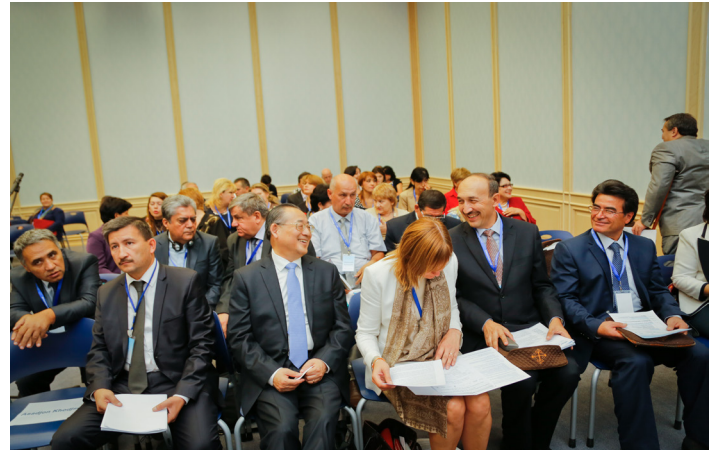
Participants of the international conference on Adult Learning and Education in Uzbekistan, 2014.

The three countries are each committed to UN-led development planning to implement the SDGs, which run from 2015 to 2030. Each country was invited to prepare a country report on ALE for UNESCO in the context of CONFINTEA VII, and to join the Sub-regional consultation. They will be participating in the Regional Conference in 2021 and then to the global Conference in Marrakesh in 2022.