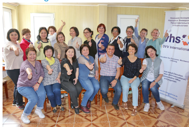
Group of participants piloting Curriculum globALE in Kyrgyzstan in 2019