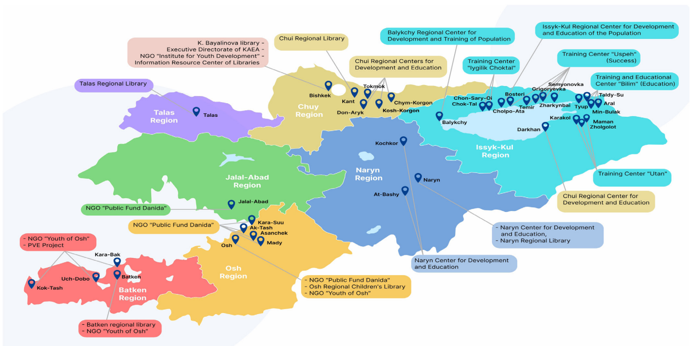
Map of Adult Training Centres – Members of the Kyrgyz Adult Education Association (KAEA). The location shown for Bishkek is KAEA's head office.

A firm legislative base is needed to secure funding of ALE. Creation of adult learning policy must be based on solid evidence highlighting the most effective practices and interventions. Resourcing is at present haphazard, various, often insecure, and in most areas of ALE need, inadequate. Clear policy commitment, legislation, and enforced regulations, including budgetary requirements, are essential to embed ALE within an applied commitment to nationwide lifelong learning as a right, and to secure its accessibility especially to remote communities and those with special needs.