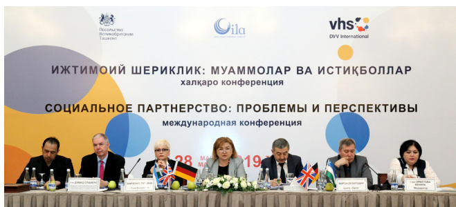
International Conference on Social partnership: Challenges and perspectives» in Uzbekistan, 2019.

Allied to the adoption of an ambitious IT (information technology) investment strategy, investment in ALE will reduce inequality, lack of access, and the partial exclusion especially of remote and rural communities. New IT on a strong national platform will enable more participation of