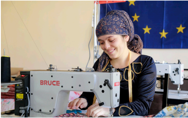
Participant of small grand programme within the frame of the EU co-funded project “Promotion of Social Change and Inclusive Education” (INCLUSION).

education suffers from an abiding lack of qualified specialists in technical specialties. The low level of knowledge of foreign languages holds Tajikistan back in the global arena.