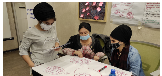
Training of trainers on basic literacy course for local CSO networks.

Coordination is poor, with no involvement of the general public, an expert community, or employers, in the discussion of problems and prospects for the development of education, especially legislation and strategies; there is one-sided emphasis on the development of the State segment of education, including in ALE.