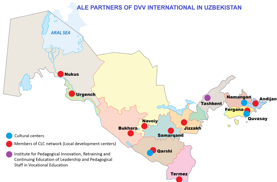
Map of Uzbekistan. Locations of civil society organisations involved in ALE partnering with DVV International are shown in red.

Statistics on financing education provided by the Educational Sector Plan of Uzbekistan (2019-2023) show that formal educational institutions (including adult education) have stable funding. However, the informal sector has no comprehensive ALE funding or statistical reporting system. The absence weakens decision-making for developing an ALE policy.