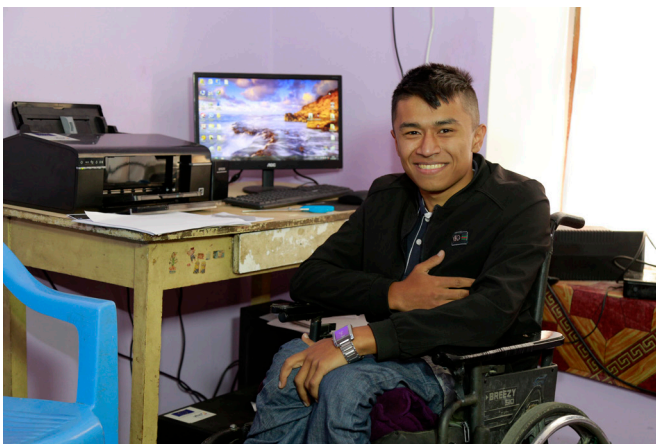
Participant of the EU co-funded project "Promotion of Social Change and Inclusive Education" (INCLUSION).

The website of the AEAT provides information about ALE, legislation, statistics and trends in ALE, and projects being implemented. But it has not yet been possible to create a national platform for dialogue and exchange of best practices and experience.